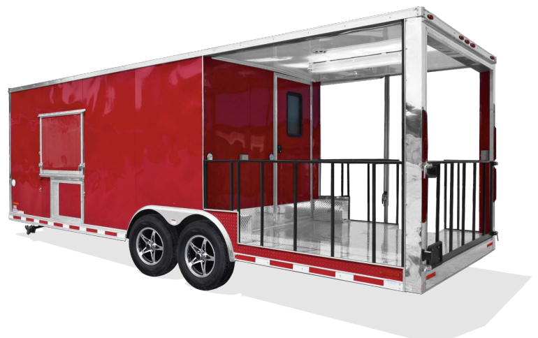
BACK PORCH BBQ TRAILER