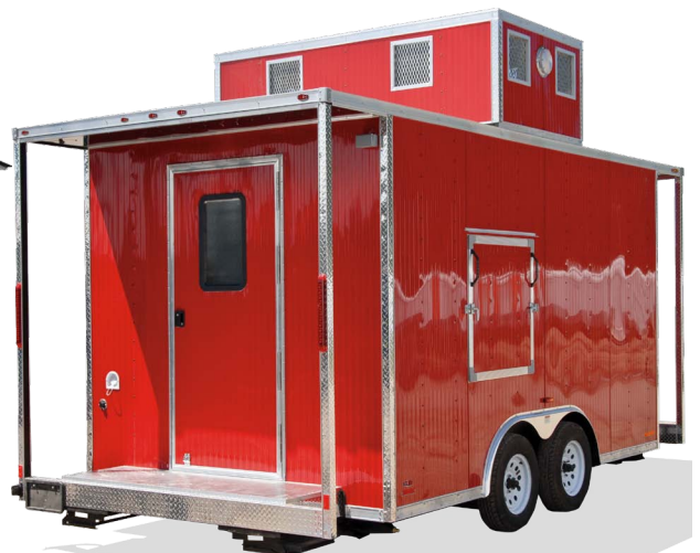
COFFEE HOUSE FRESH BREW, DELIVERED To You!