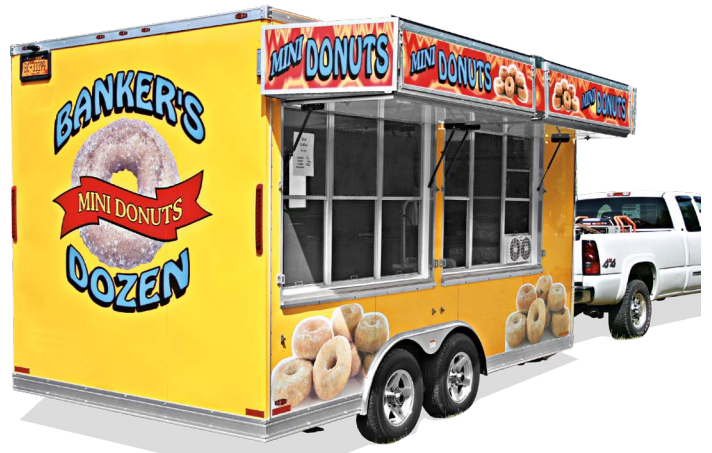
QUICK TO SETUP