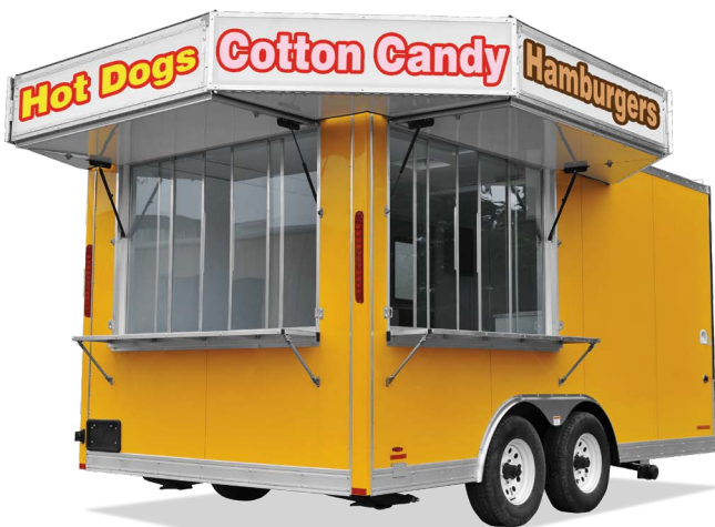
EFFICIENT FULL SERVICE