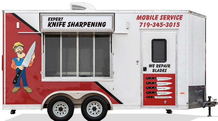
MAC THE KNIFE'S NEW JOB