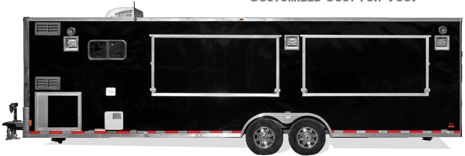
FULL SIZE VENDING TRAILER WITH GENERATOR AND AIR CONDITIONING