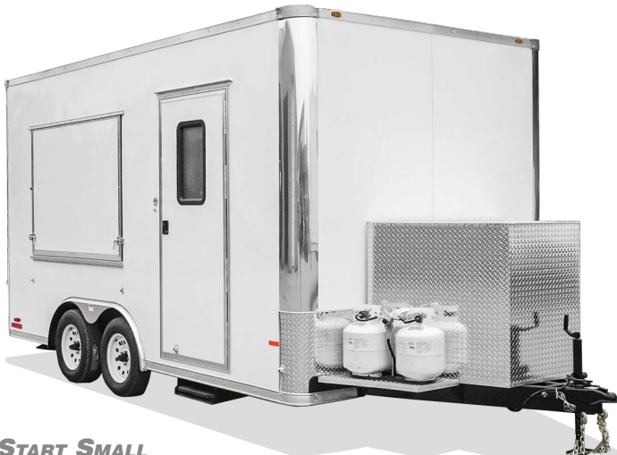
START SMALL WITH ALL OF THE BASICS