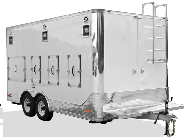
YUMMY YOGURT To Go TRAILER