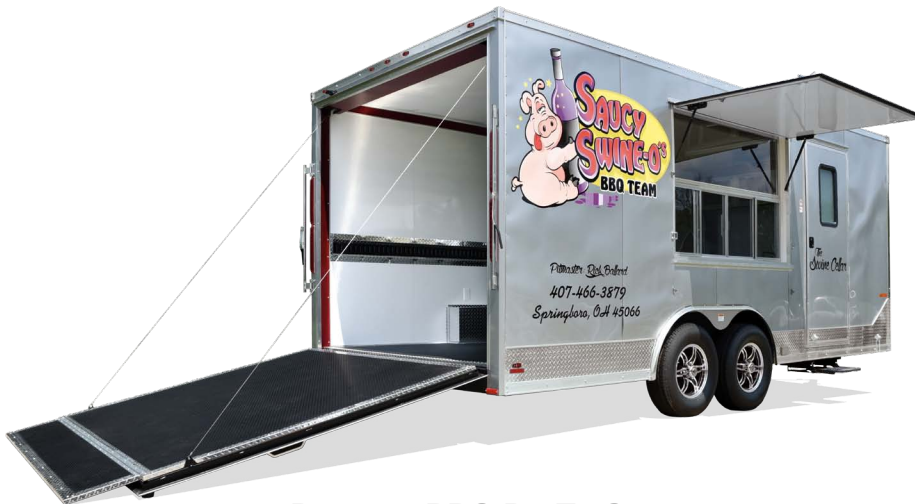
PORTABLE BBQ PIT To Go