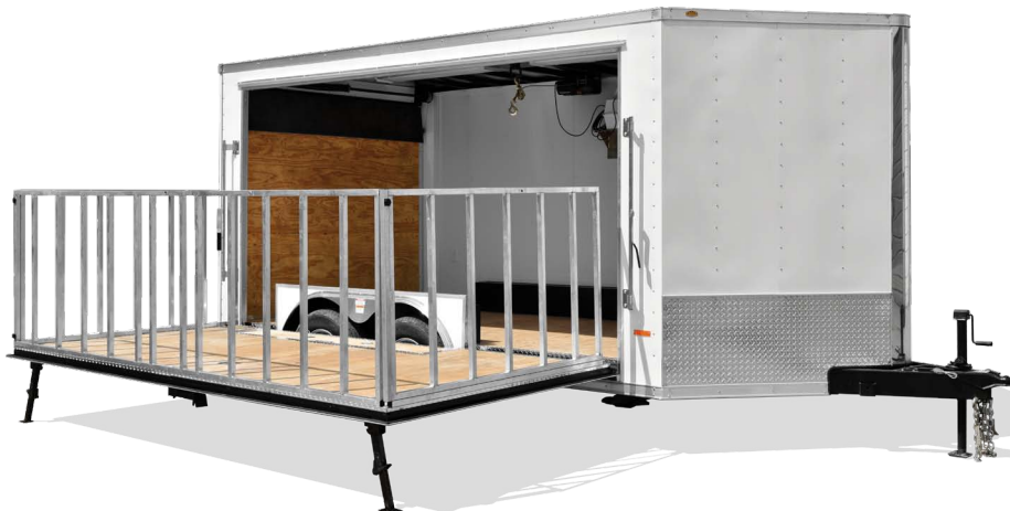
MERCHANDISING AND PRESENTATION TRAILER