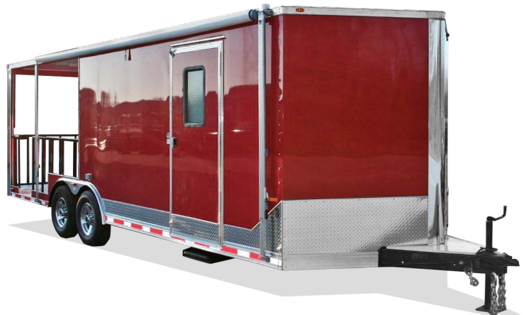
ADD A WEDGE NOSE FOR MORE STORAGE!